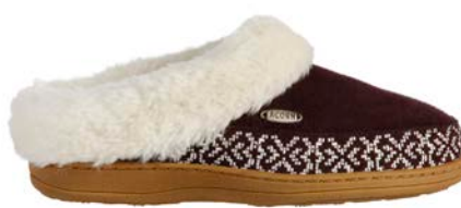
RAISIN WS-WXL // A23012 RSN