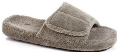
GREY MS-MXXL // A10602GRY