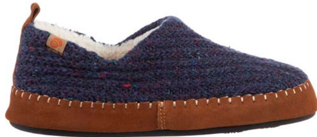
NAVY BLUE MEN'S MS-MXL // A19020NBL

Additional colors available online: NTW, BLK, ACF, GPL, BLP, BWT