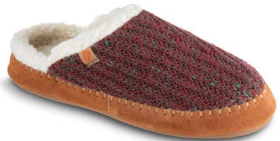
GARNET WS-WXL // A20136GAR