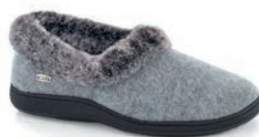
STONE WS-WXXL | WSw-WXLw A10765STO