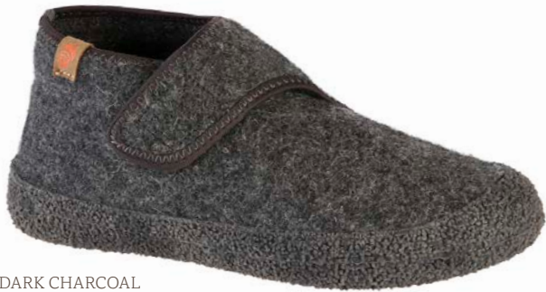
DARK CHARCOAL M8-13 // A23416 DCH

recycled felt and a flexible sole for a natural walking experience