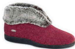
CRACKLEBERRY WS-WXL // A11043BEH