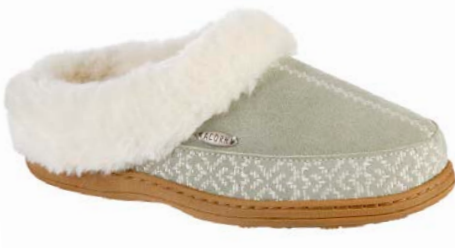
DESERT SAGE WS-WXL // A23012 DSS