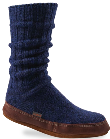
COBALT RAGG WOOL A10118CWL