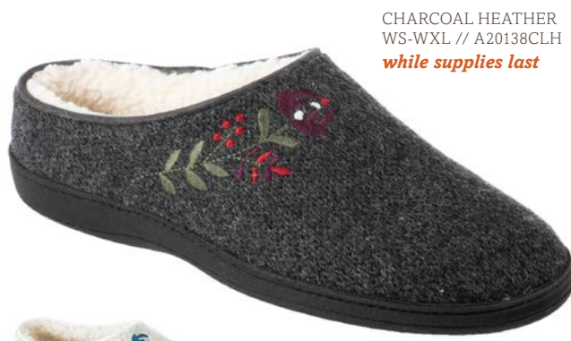
CHARCOAL HEATHER WS-WXL // A20138CLH while supplies last