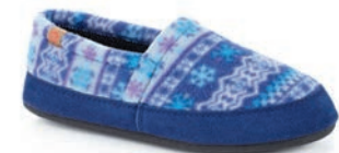
ICELANDIC BLUE WS-WXL // A10080CAK