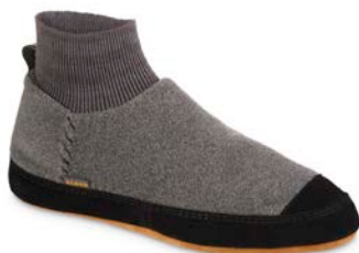
CHARCOAL XS-XL // A22601CHA