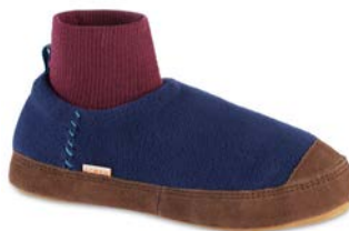
NEW NAVY BLUE XS-XL // A22600NBL