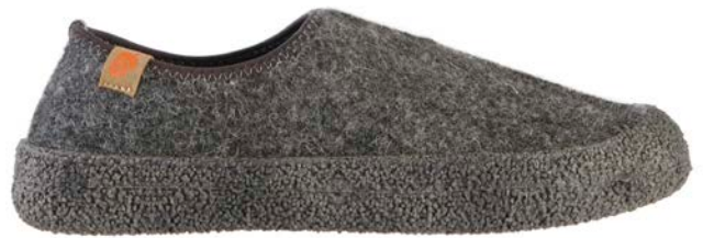
DARK CHARCOAL M8-13 // A23415 DCH