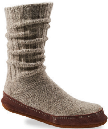
PART #: DFFORMSLP1SZ Mid-calf height 12"