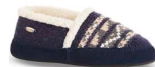
NORDIC BLUE WS-WXL // A18605NOB