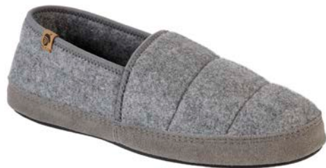
CHARCOAL HEATHER MS-MXL // A23413 CHA