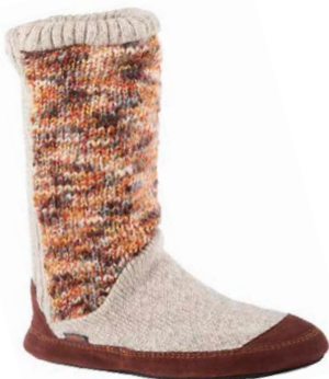
SUNSET CABLE KNIT WS-WXL // A10161SCK