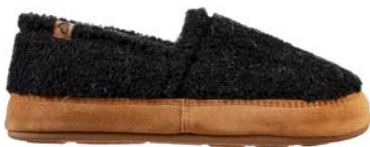
BLACK WS-WXL // A21206BLK