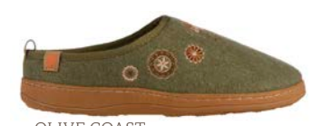
OLIVE COAST WS-WXL // A23014 OLV