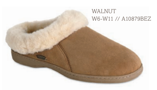
WALNUT W6-W11 // A10879BEZ

* Upper in Walnut, with Chestnut shearling lining.