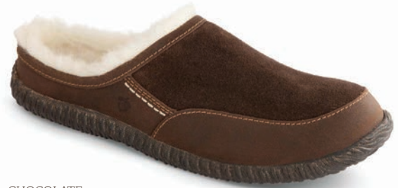
CHOCOLATE M8-M13 // A50019CHO