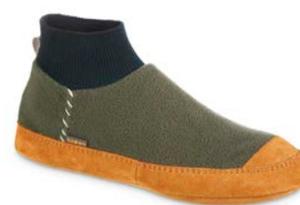
DARK PINE XS-XL // A22601DKE while supplies last