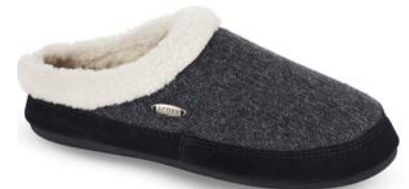
DARK CHARCOAL HEATHER WS-WXL // A17100DCT