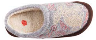
HEATHER GREY HARE WS-WXL // A10077HGH