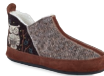
CHOCOLATE WS-WXL // A10079CHO