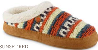
SUNSET RED WS-WXL // A20137SRE