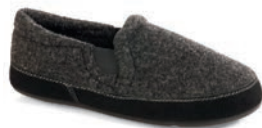
BLACK TWEED MS-MXXL | MSw-MXLw A11172BTD