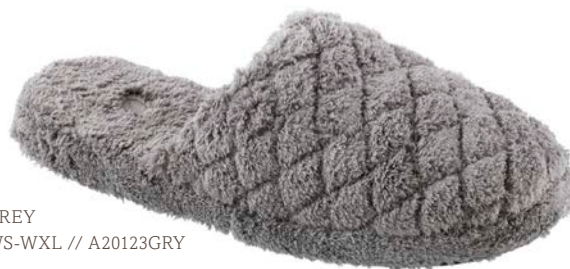
GREY WS-WXL // A20123GRY