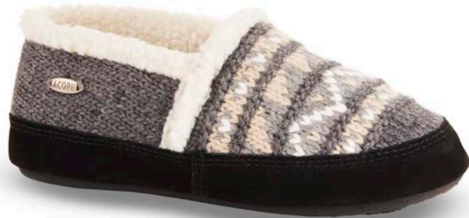
NORDIC GREY WS-WXL // A18605CBB