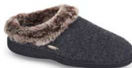
DARK CHARCOAL HEATHER WS-WXL // A17101DCT while supplies last