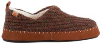
WALNUT WOMEN'S WS-WXL // A19019WAL