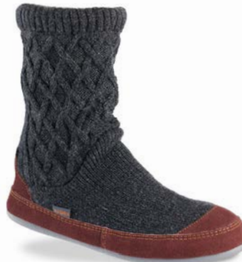
NEW CHARCOAL A10161CHA // WS - WXL A10162CHA // MS - MXL

NEW! fisherman's knit pattern for men & women