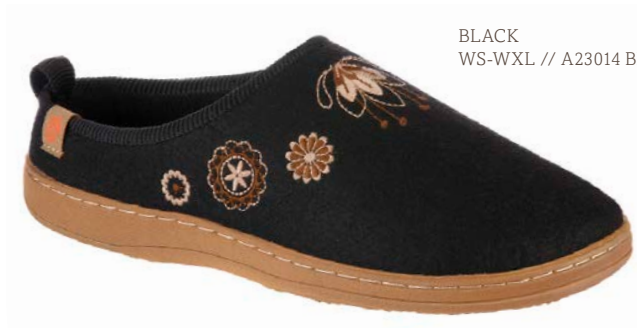
BLACK WS-WXL // A23014 BLK