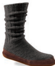
CHARCOAL RAGG WOOL A10118CRW