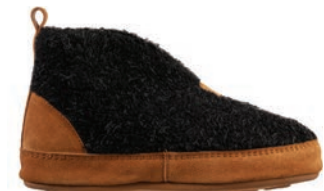
BLACK WS-WXL // A21203BLK