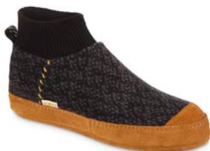
BLACK XXS-M // A22600BLK