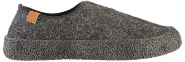
DARK CHARCOAL W 6-11 // A23015 DCH