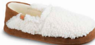
BUFF POPCORN WS-WXL // A20132ACC