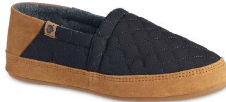
BLACK WS-WXXL // A24003 BLK