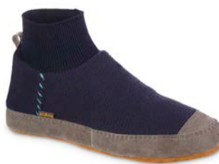
NAVY BLUE XS-XL // A22601NBL