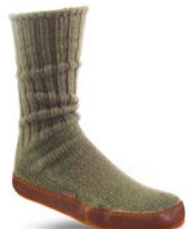
OLIVE COAST A10118OLV