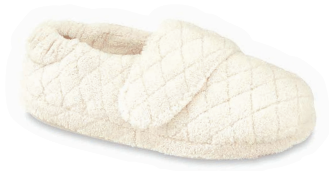
NATURAL WS-WXXL // A10631AAH