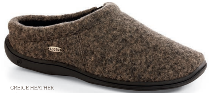
GREIGE HEATHER MS-MXXL // A10126BHP