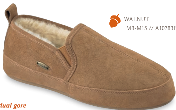
WALNUT M8-M15 // A10783BEZ