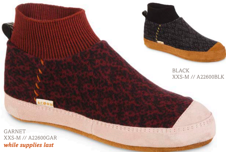
GARNET XXS-M // A22600GAR while supplies last