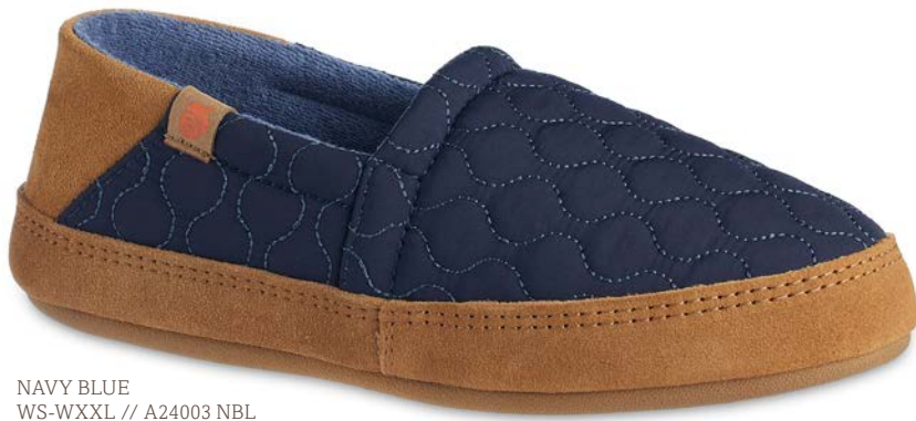
NAVY BLUE WS-WXXL // A24003 NBL