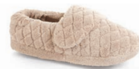
TAUPE WS-WXL // A10631TAU