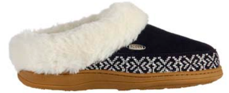
NAVY BLUE WS-WXL // A23012 NBL