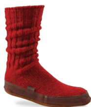
CRIMSON RAGG WOOL A10118CGW