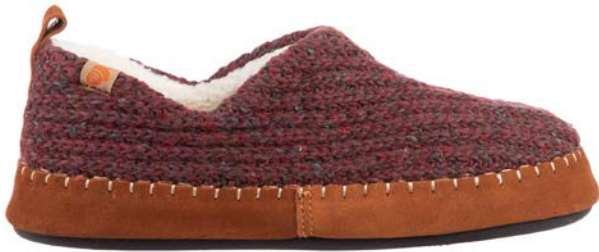
GARNET WOMEN'S WS-WXL // A19019GAR