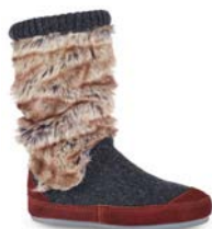
CHARCOAL FAUX FUR WS-WXL // A10161ADS