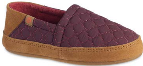
RAISIN WS-WXXL // A24003 RSN