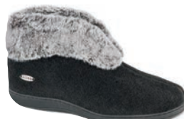
BLACK WS-WXL // A11043AAA