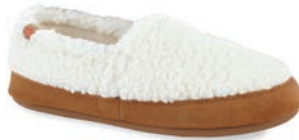
BUFF POPCORN WS-WXXL // A10080ACC