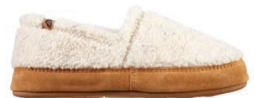
NATURAL MS-MXL // A21205NAT while supplies last