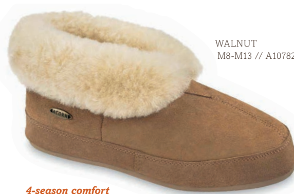
WALNUT M8-M13 // A10782BEZ