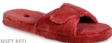
SUNSET RED WS-WXXL // A10155SRE