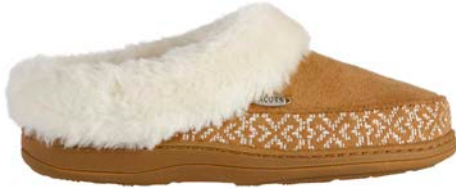
BUCKSKIN WS-WXL // A23012 SKN