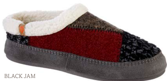
BLACK JAM WS-WXL // A21200 BJA