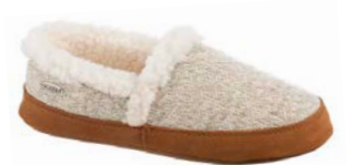
OATMEAL HEATHER WS-WXL // A10153OMH