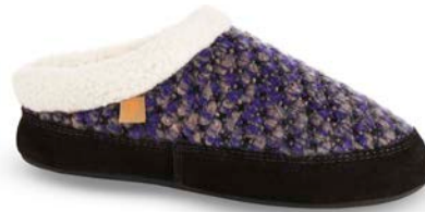
BLUEBERRY WS-WXL // A18624BLB