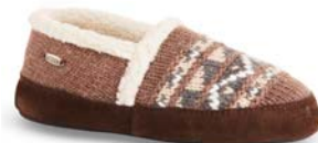
NORDIC BROWN WS-WXL // A18605NOR