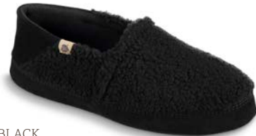
BLACK MS-MXL // A20144ACE