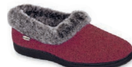
CRACKLEBERRY WS-WXXL | WSw-WXLw A10765BEH