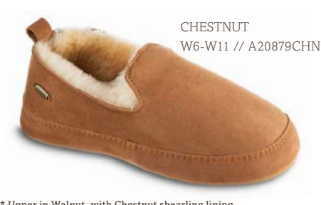
CHESTNUT W6-W11 // A20879CHN