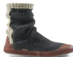
CHARCOAL RAGG WOOL MEN'S MS-MXL // A10162CRW