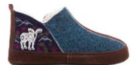
NAVY BLUE MOOSE WS-WXL // A10079NAM