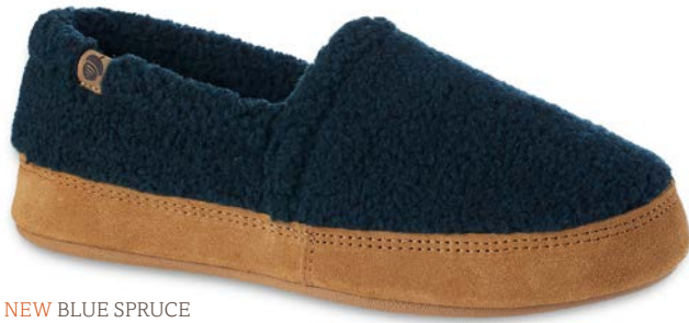
NEW BLUE SPRUCE MS-MXXL // A10086DCH