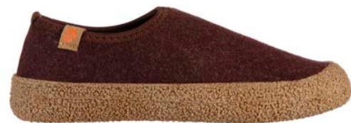
WALNUT M8-13 // A23415 WAL