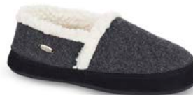
DARK CHARCOAL HEATHER WS-WXL // A10153DCT