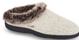
CHARCOAL HEATHER WS-WXL // A17101BWP while supplies last