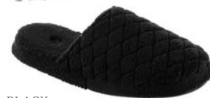
BLACK WS-WXL // A20123BLK