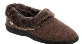
SMOKY TAUPE WS-WXXL | WSw-WXLw A10765SKT