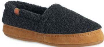
NEW DARK CHARCOAL WS-WXL // A10080 DCH