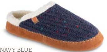
NAVY BLUE WS-WXL // A20136NBL