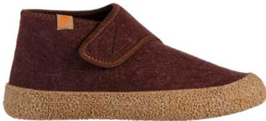
RAISIN W 6-11 // A23016 RSN