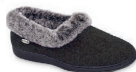
BLACK WS-WXXL | WSw-WXLw A10765AAA