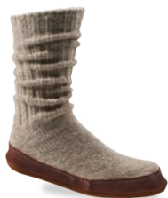
LIGHT GREY RAGG WOOL A10118LRW