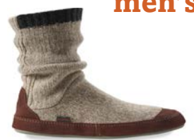
GREY RAGG WOOL MEN'S MS-MXL // A10162ACK