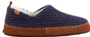
NAVY BLUE WOMEN'S WS-WXL // A19019NBL