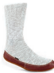
LIGHT GREY COTTON TWIST A10118LCT