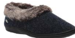
NAVY BLUE WS-WXXL | WSw-WXLw A10765NBL