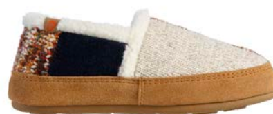
SUNSET RED WS-WXL // A21201 SRE