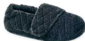
BLACK WS-WXL //A10631AAA