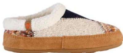
SUNSET RED WS-WXL // A21200 SRE