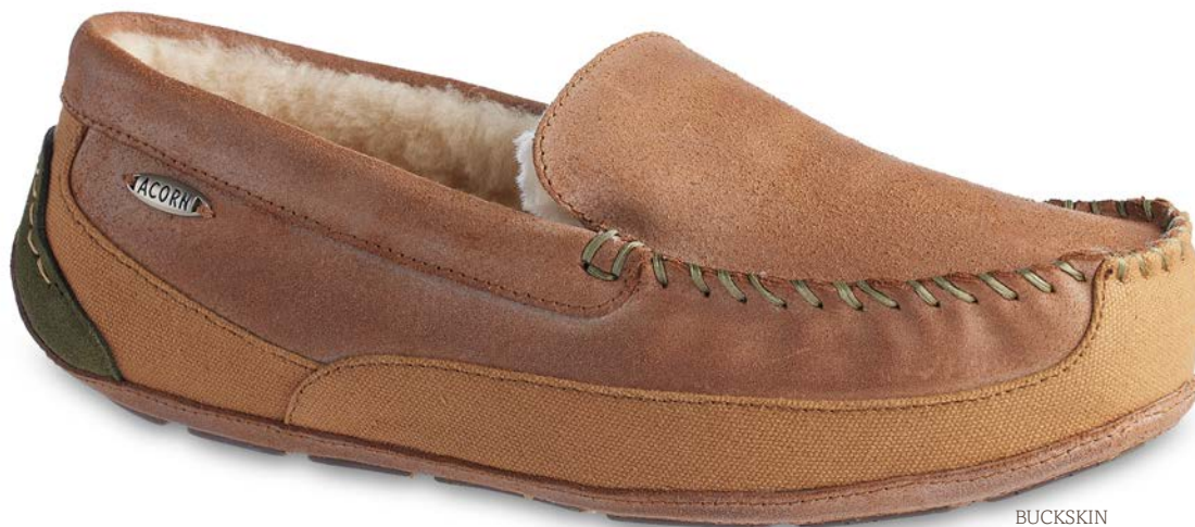
indoor + outdoor hamilton driving moc

Introducing our Newest Style with 4-Season Natural Comfort