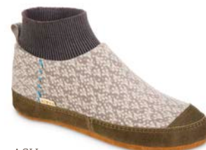
ASH XXS-M // A22600ASH