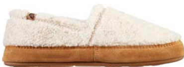
NATURAL WS-WXL // A21206NAT