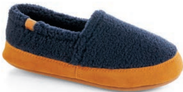
NAVY POPCORN WS-WXL // A10080 NPC