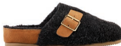
BLACK WS-WXL // A21202BLK