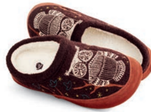
CHOCOLATE WS-WXL // A10077CHO