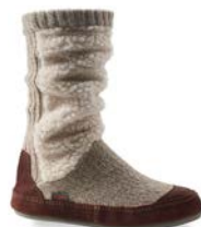
BUFF POPCORN WS-WXL // A10161ACC