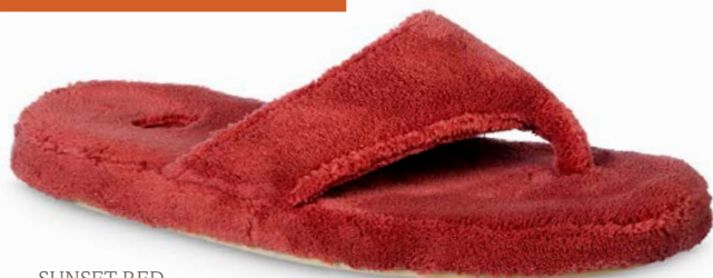
SUNSET RED WS-WXXL // A10454SRE