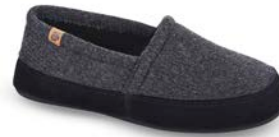
DARK CHARCOAL MS-MXXL // A10086DCH