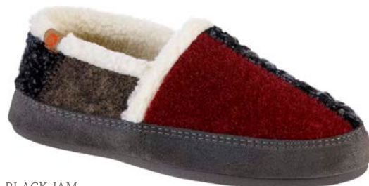
BLACK JAM WS-WXL // A21201 BJA