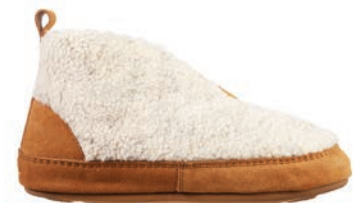
NATURAL WS-WXL // A21203NAT