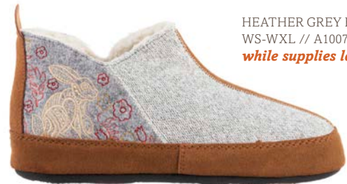
HEATHER GREY HARE WS-WXL // A10079HGH while supplies last