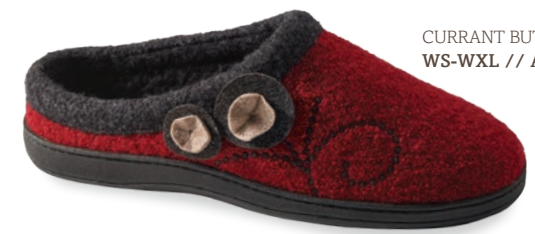
CURRENT BUTTON WS-WXL // A10151CUR