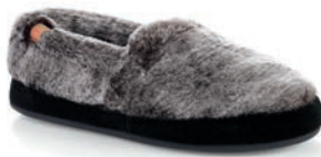
CHINCHILLA WS-WXL // A10080ADS