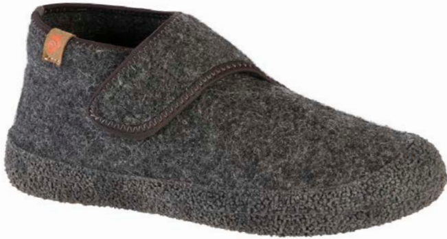
DARK CHARCOAL W 6-11 // A23016 DCH

recycled felt and a flexible sole for a natural walking experience