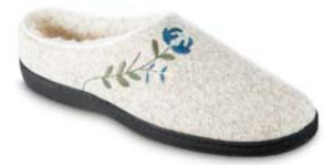
OATMEAL HEATHER WS-WXL // A20138OMH while supplies last