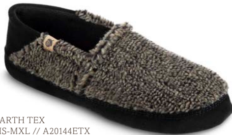
EARTH TEX MS-MXL // A20144ETX