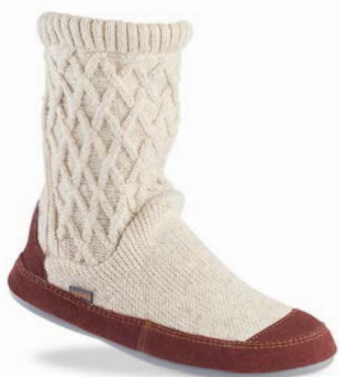
NEW OATMEAL HEATHER A10161OMH // WS - WXL A10162OMH // MS - MXL