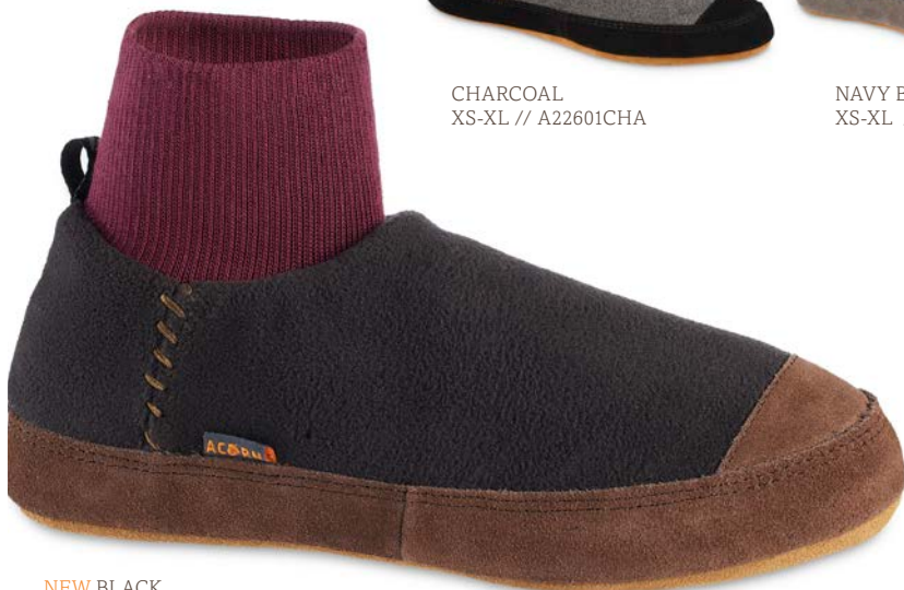
NEW BLACK XS-XL // A22601BLK