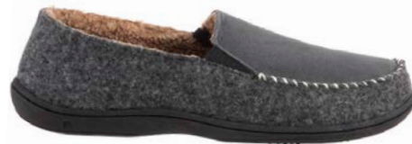
ASH MS-MXXL // A19016ASH