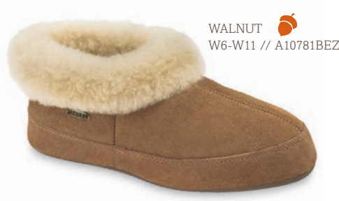
WALNUT W6-W11 // A10781BEZ