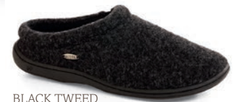
BLACK TWEED MS-MXL // A10126BTD