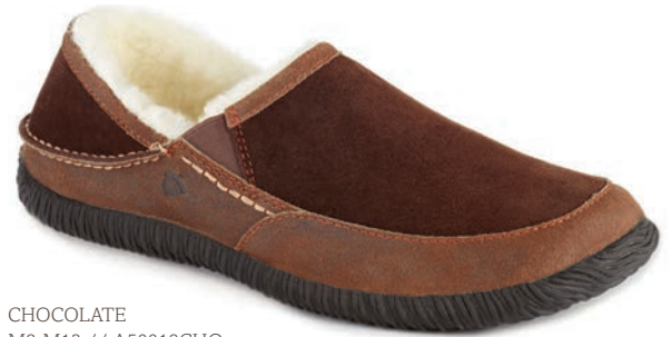
CHOCOLATE M8-M13 // A50018CHO