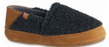
NEW DARK CHARCOAL WS-WXL // A20132DCH