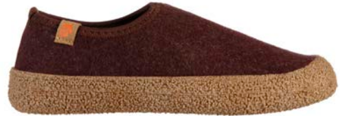
RAISIN W 6-11 // A23015 RSN