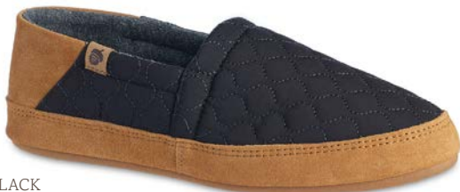
BLACK WS-WXXL // A24004 BLK